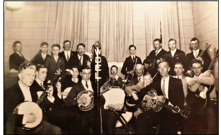
Pocopson Valley Boys, WDEL